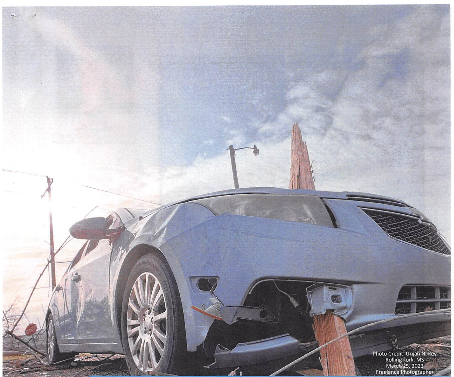
Photo Credit: Urijah N. Key Rolling Fork, MS March 25, 2023 Freelance Photographer