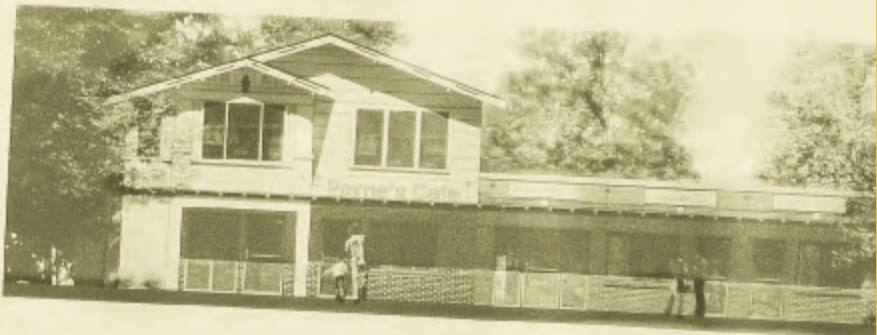
Wayne's Two-Story Front Elevation of Suna City | November 2006